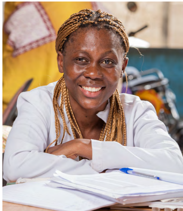
Figure 3. Healthcare worker in Nampula, Mozambique

A recurring theme from interviews and the literature was ensuring that the PPPs were initiated with stakeholders who have similar priorities and share co-alignment toward the goal of the partnership, like increasing vaccination coverage. As an interviewee from a not-for-profit organization highlighted, while administrative or technical challenges like information and data sharing can be overcome by boilerplate nondisclosure agreement (NDAs),