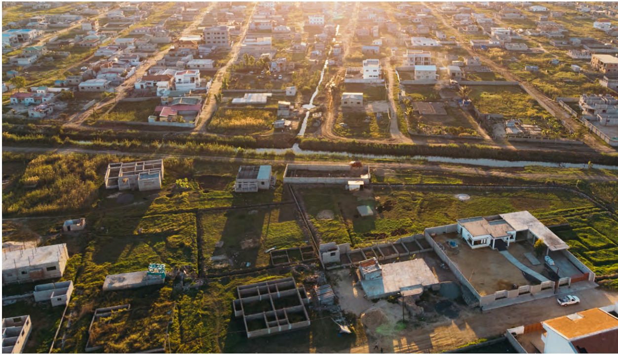
Figure 3. Mozambique neighbourhood

to ascertain the truth value of a stated goal. Due to this and the dynamic nature of strategic goals, a robust mechanism for resolving potential conflicts is prudent.