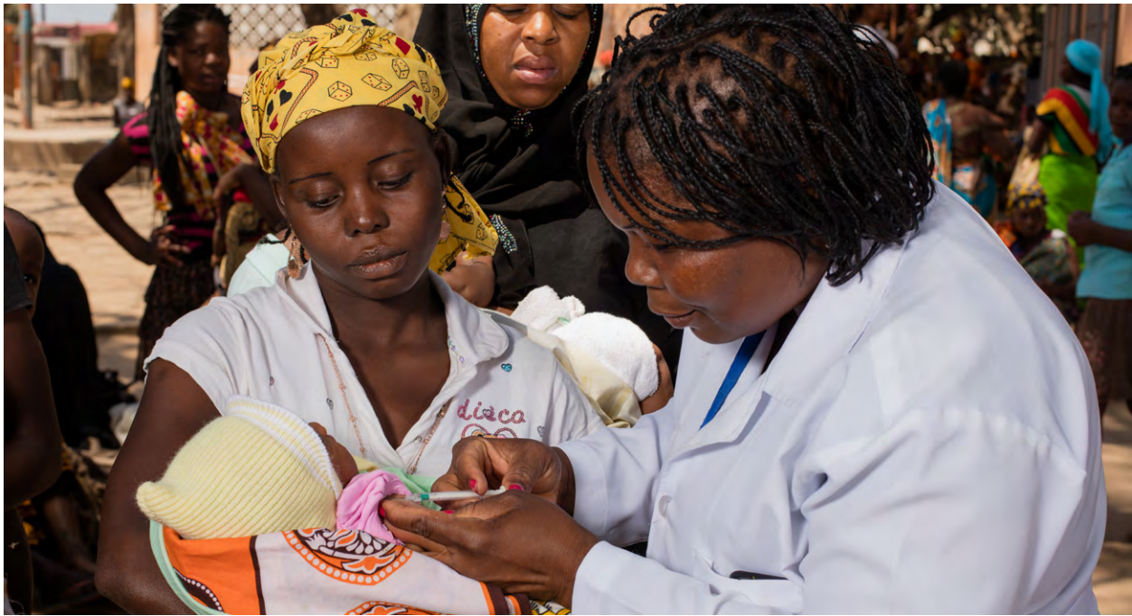
Figure 1. Healthcare worker vaccinating a child in Nampula, Mozambique

level of commitment within the collaboration. We examine the relationships, responsibilities and learnings of various stakeholders involved, with specific reference to their impacts on the mVacciNation pilot in Mozambique.