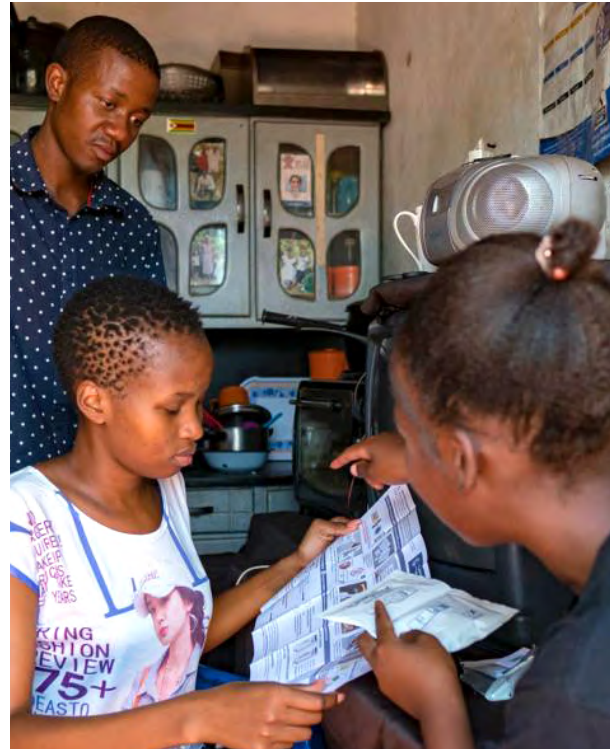
Figure 2. A Zvandiri YMM counselling a young mother and her partner

Management-level employees within AfricAid's Zvandiri are enthusiastic about expanding the YMM program as well as a younger mentor dads model, with a goal of expanding the Zvandiri model to 20 countries and reaching over 1 million youth living with HIV by 2030. 16 Zvandiri follows the UN's General Assembly goal of 95-95-95 targets, which they have embedded into their own campaign against the HIV epidemic. The goal "calls on countries to provide effective HIV combination prevention options to 95 per cent of all people at risk of acquiring HIV; get 95 per cent of people living with HIV aware of their HIV status; get 95 per cent of people who know their status to be on HIV treatment; and for 95 per cent of people on HIV treatment to be virally suppressed." 17 However, some interviewees