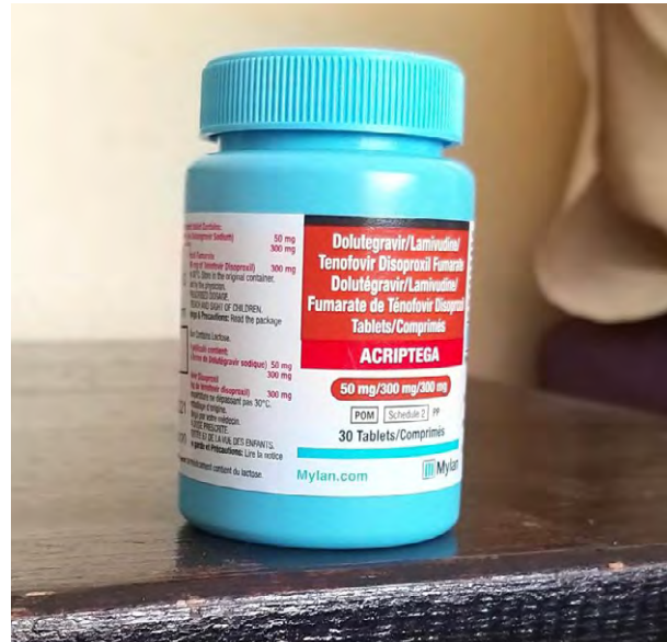
Figure 3. HIV treatment medication

Others provided more specific details regarding ease of access to HIV testing and treatment outside of the program. Interviewees commented on the unique programs that Zvandiri offers and how they are not as accessible outside the