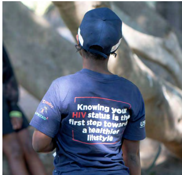
Figure 5. YMM staff member outside the head office

These young mothers are at high risk of complications when they travel, not only because of their HIV status, but also because they are often carrying children and are possibly