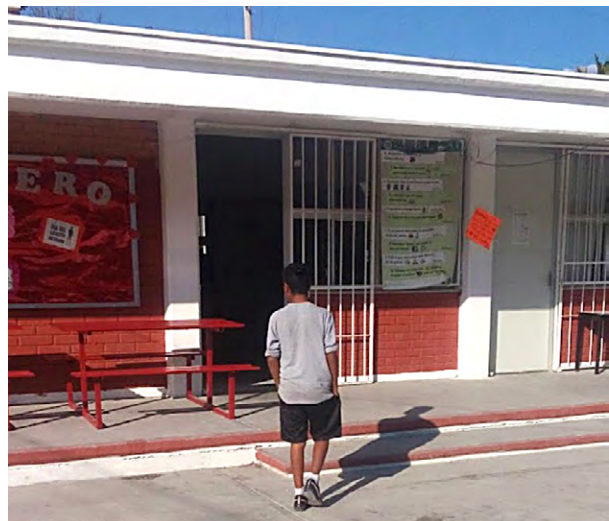
Figure 4. School in San Ángel neighbourhood

few years teenagers can find themselves forming big families in which the elder siblings have to contribute in the upbringing of the youngest.”