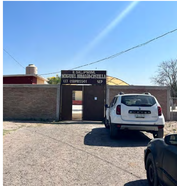
Figure 2. Miguel Hidalgo Elementary School in La Luz