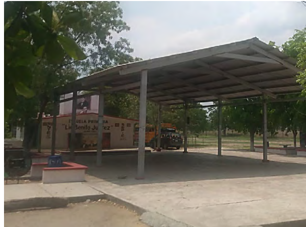
Figure 3. Lic. Benito Juárez Elementary School in Sinaloa