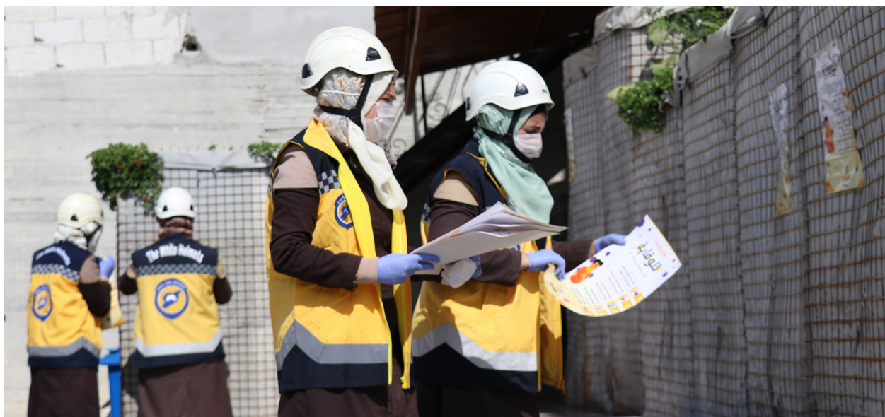
Figure 1. White Helmets volunteers putting up COVID-19 informational posters

As a part of the project, an existing White Helmets' uniform factory pivoted to manufacture PPE. The plan was to produce masks, protective gowns, and face shields for White Helmets volunteers and healthcare workers. These populations are particularly important to protect because of the already significant shortages in staff and their critical roles in providing aid to the public. By procuring a medical waste incinerator, they were able to properly dispose