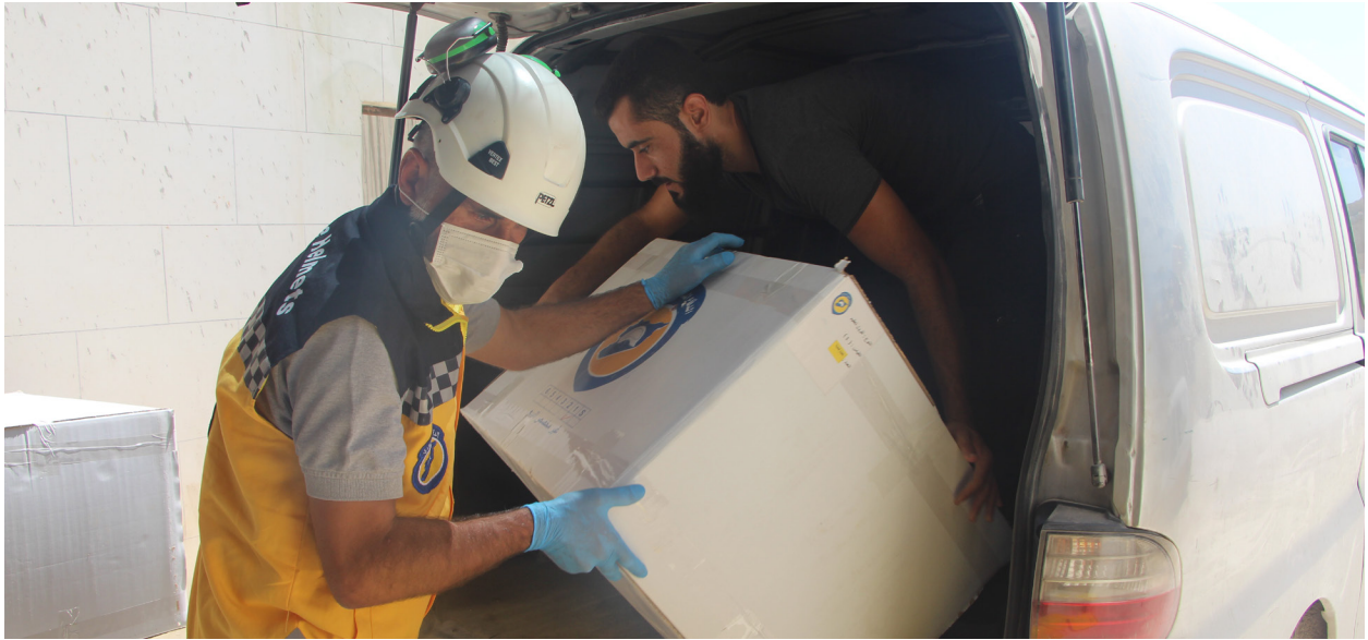
Figure 2. White Helmets volunteer picking up masks for distribution

zone for a humanitarian response. The success of the project also suggests that this aid modality should be given more attention.