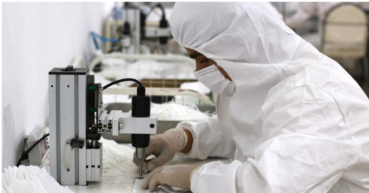
Figure 3. Factory employee working on a mask for distribution

Being able to leverage the community's trust is another advantage for local organizations. Building more trust in the long term ultimately expands their scope of work and the beneficiaries of the projects. The White Helmets' PPE project provides a clear example of this leverage and