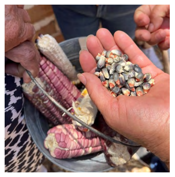
Figure 5. Corn grown by the collective of farmers

Women's role in the household — including childcare — has a critical relationship to their participation in land-defending collectives. In these collectives, most of the women have families and are responsible for domestic tasks such as cooking. Because agriculture and food consumption are so directly linked to the land that produces food, those who are typically responsible for cooking it value the food sources. By extension, there is also an increased interest in protecting land from contamination and degradation because of this link to women's domestic responsibilities in the region. The farmers' collective emphasized their desire to provide children with healthy foods that are grown without agrichemicals.