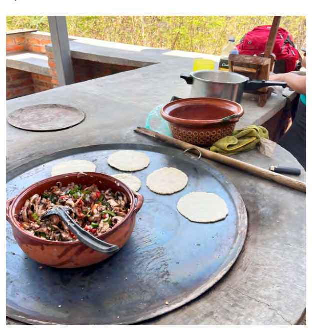
Figure 6. An outdoor kitchen in the orchard/plant nursery with tortillas, mushrooms, and vegetables cooking on the wood stove

Across all three collectives, the social relations and interactions within them are integral to their continued operation. Multiple members echoed that without friendship between the volunteers, the initiatives would not be able to survive or operate as they do now. Because of this rapport between members, volunteers can continue to participate thanks to the accommodation that the group provides them. For example, in the orchard, one of the members mentioned how the orchard volunteers helped her with her young children when she volunteered. This is important for expanding community involvement, and other members described this collective as "not a machine — [the orchard] is alive and the door is open."