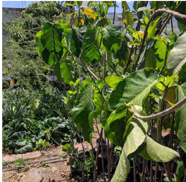
Figure 2. Bagged plants intended for replanting in the plant nursery/orchard initiative

Cancer, respiratory issues, and kidney failure are common according to both the Inter-American Commission on Human Rights Resolution and the participants we interviewed.<sup>9</sup>