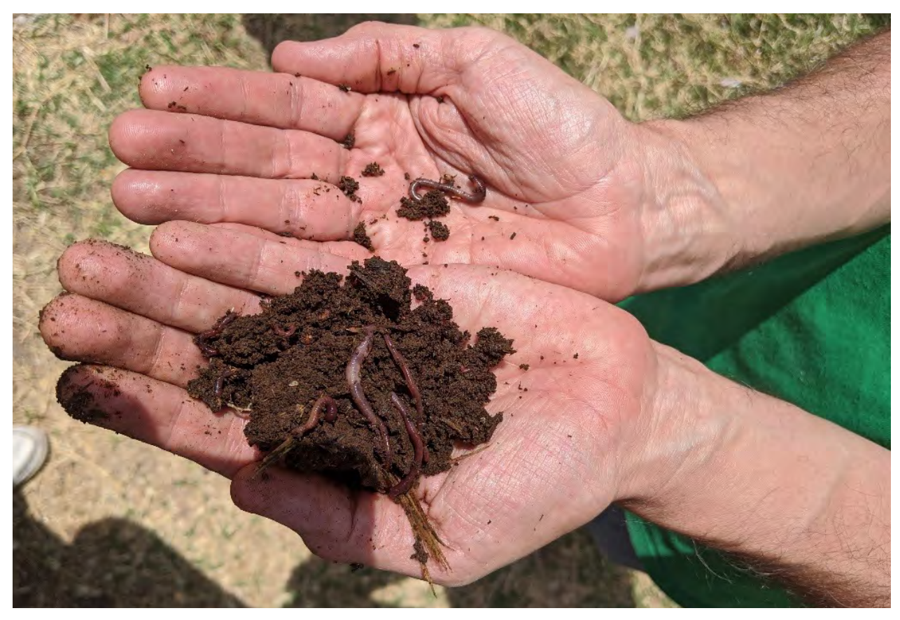
Figure 4. Part of the composting matter used in the farming collective

Finally, the collective has been hosting embroidery sessions every Wednesday for the past eight years. Members told us that these sessions created space for them to both socialize and discuss the collective, as well as discuss various environmental problems the community faces. The discussions lead to potential advocacy measures. While they embroider, members connect with each other, and lean on each other for emotional support, which they find reenergizes them.