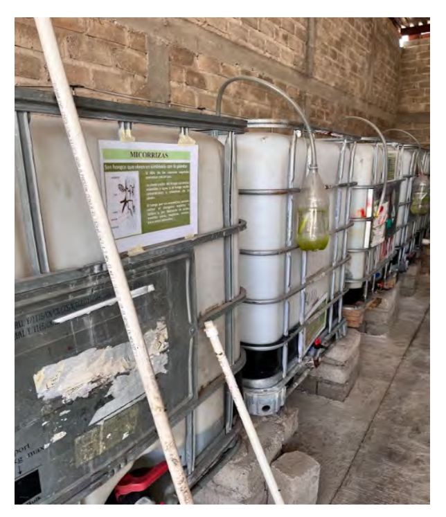
Figure 3. Bacteria and fungi grown in large tanks are used as natural pesticides or other ways to aid plant

Initially the group of women who started the collective came together when a mine had plans to occupy some of the agricultural lands surrounding the town. The leader of the collective described how the thought of breathing in morning air filled with dust particles had motivated her to want to act and defend her land. Ultimately, they managed to prevent the mine from being established, but it took a significant emotional, mental, and financial toll on those who were involved.