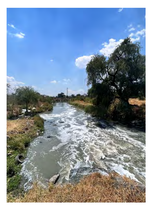
Figure 1. A stream of the Santiago River that has been partially treated covers a nearby tree with a black film

of Jalisco have caused great harm for those living in the Lerma-Chapala-Santiago basin. In 2010, the State Water Department (CEA) completed a study that examined traces of pollutants in children's blood in the periphery region of Guadalajara. They found high levels of heavy metals and organic compounds. Pollutants correlated to industrial activity found in the river can be cancerous and corrosive when in contact with skin. They can also affect the reproductive system and impede kidney function. A study in Agua Caliente found that children there have