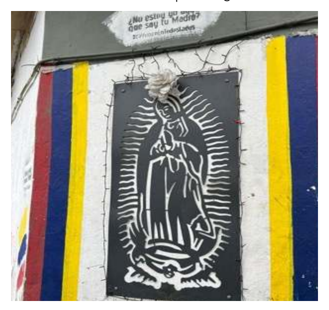
Figure 1. A metal plate of the Virgin of Guadalupe with a painting of Colombia's flag colours, in the Independencia neighbourhood

Although the Kolombia Regia is a male-dominated movement, women have always had a strong if unrecognized presence within it. Historically, their roles have been defined in relation to men, particularly to their husbands, in matters such as running family businesses and organizing community events. Despite these historical dynamics, women have gradually created their own legacy with all-female music ensembles, sonideros, and public figures.