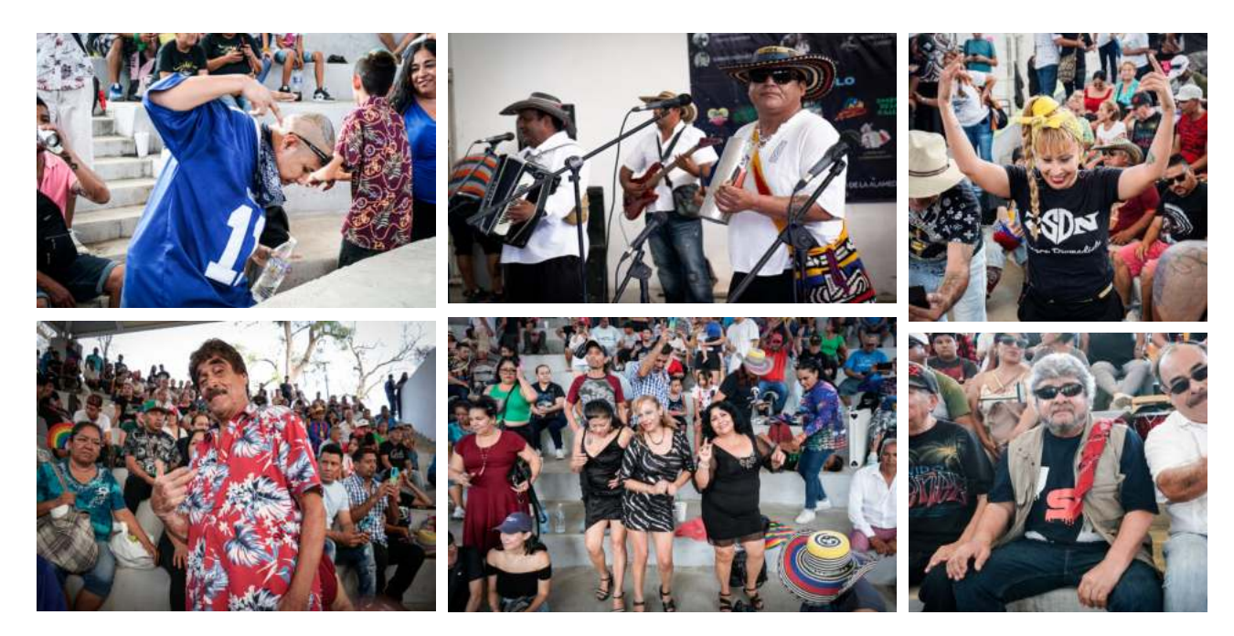
Figure 2. (From upper left to bottom right) Cholombiano man with a shaved and tattooed head, wearing a baggy sports shirt, dancing Cumbia Rebajada during Monterrey's Cumbiafest 2023. A music ensemble performing in Monterrey's Cumbiafest 2023. Cholombiana with a braided high ponytail and a bandana. She wears a sonidero's shirt and makes typical Kolombian hand gestures during Monterrey's Cumbiafest 2023. Celso Piña archetype — a man dressed in a red tropical shirt and making typical Kolombian hand gestures during Monterrey's Cumbiafest 2023. Texan style — a group of women, wearing dresses and heels, dance and sing during Monterrey's Cumbiafest 2023. "80s Rock style" archetype — a man dressed in a black shirt with a vest, dark sunglasses, and a bandana during Monterrey's Cumbiafest 2023

society like Monterrey, and many times it is related with crime. As one Kolombian told us,