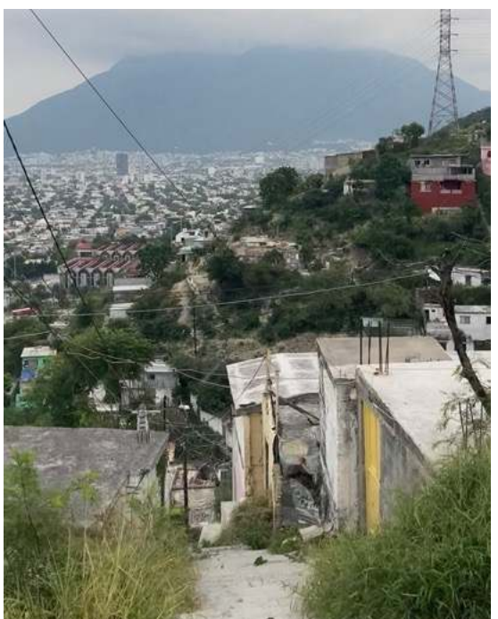
Figures 6 and 7. Housing in the mountainous zone of La Independencia neighbourhood