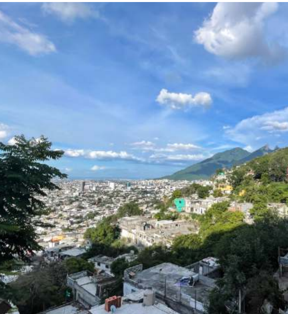
Figures 4 and 5. Campana Altamira and La Independencia neighbourhoods. Even from afar, these houses are easily distinguished because of their bright colours